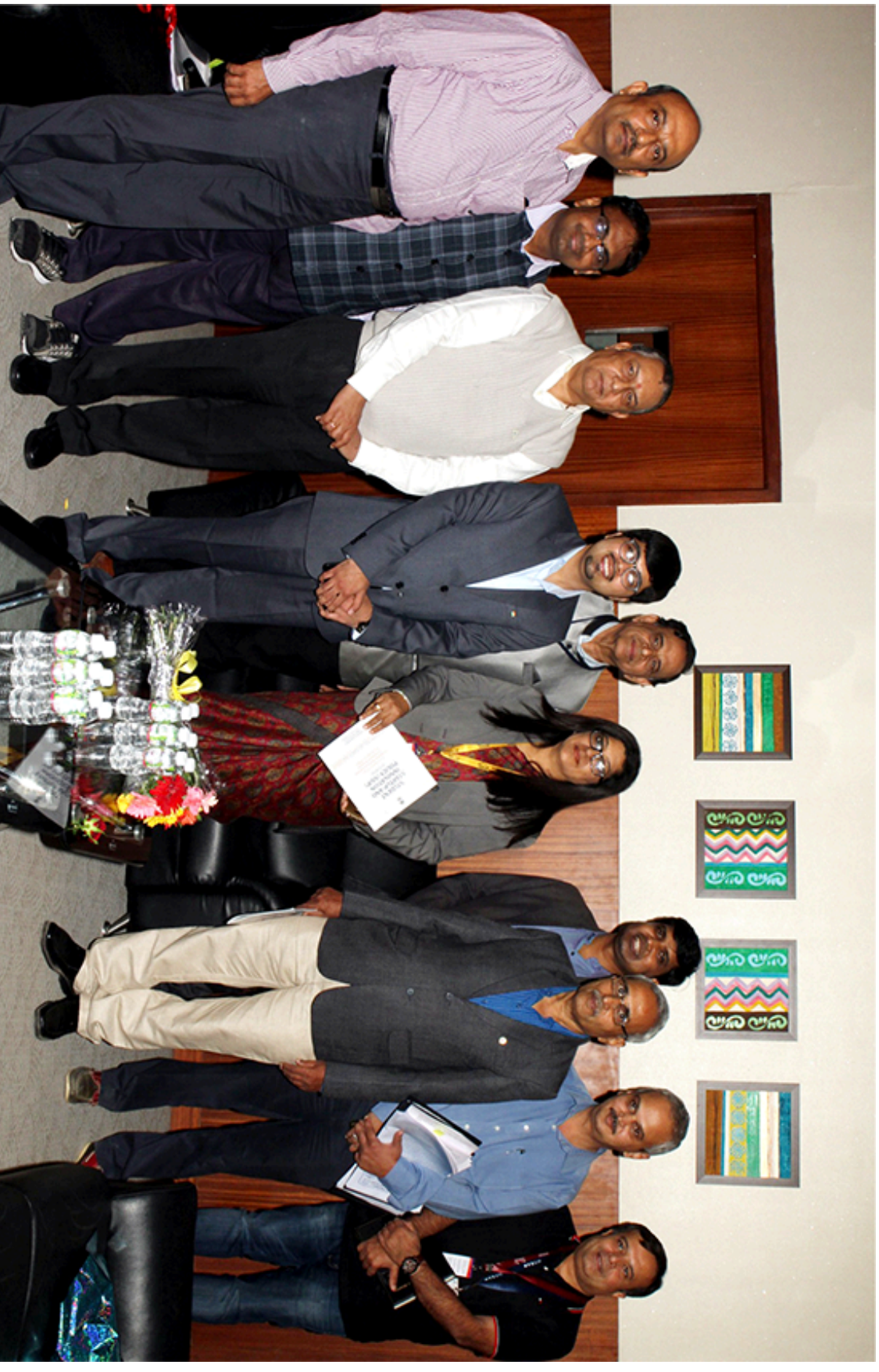
Members of the policy drafting committee along with other officials of the Education Department, Government of Gujarat, at Mahatma Mandir on January 8, 2017, following the unveiling of the Student Startup and Innovation Policy