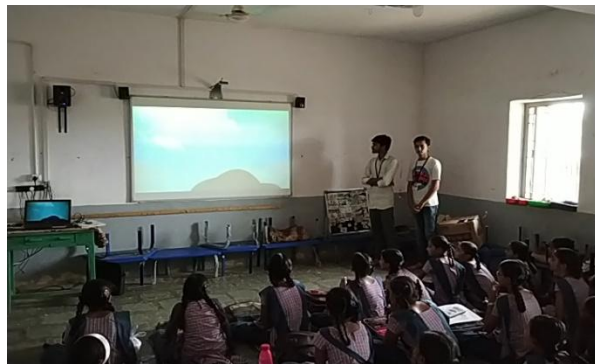
Movie screening in Budhel Kanyashala