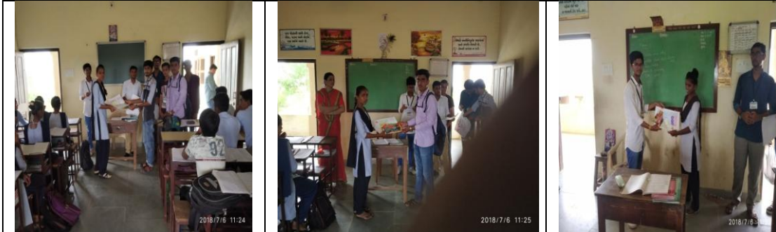
Prize distribution of drawing competition

On the ninth day of internship, we first conducted prize distribution event of drawing competition in secondary school and explained importance of cleanliness to every student. We selected many best drawings and on the base of creative idea to clean India or cleanliness, we gave 1 st to 10 th ranks. After completion, we conducted door to door visit and 20 house covered and 212 people were sensitized.