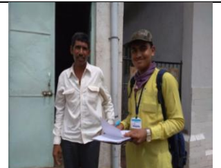
Door to door visit