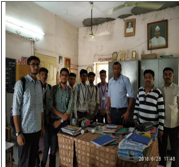
Meeting with Principal of primary school

The first day of an internship was quite exciting and as per the planning, following activities were carried out: