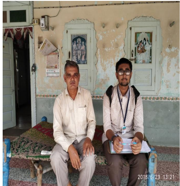
Door to door visit

On the second day of an internship, we divided into groups for the continuation of conducting door to door awareness and household data collection activities.