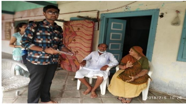
Door to door visit