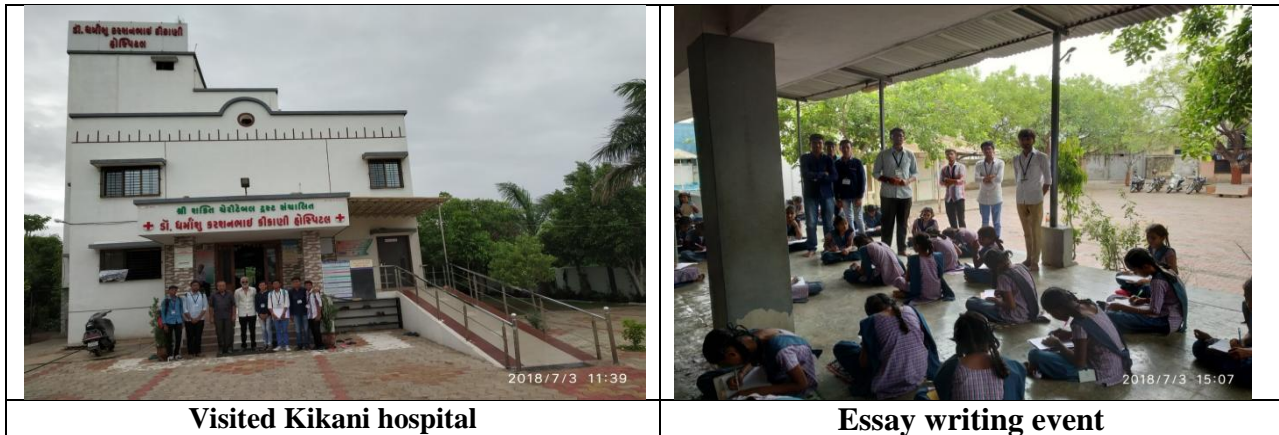
Visited Kikani hospital

The sixth day of an internship was very delightful as we visited hospital for observing its cleanliness and also conducted an essay writing event in school. As per the planning, following activities were carried out: