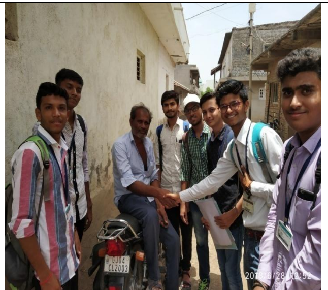
Door to door visit

On the first day of an internship, we first met Principal of primary school, to discuss essay writing and for rally event planning. Then after, we met Principal of secondary school both