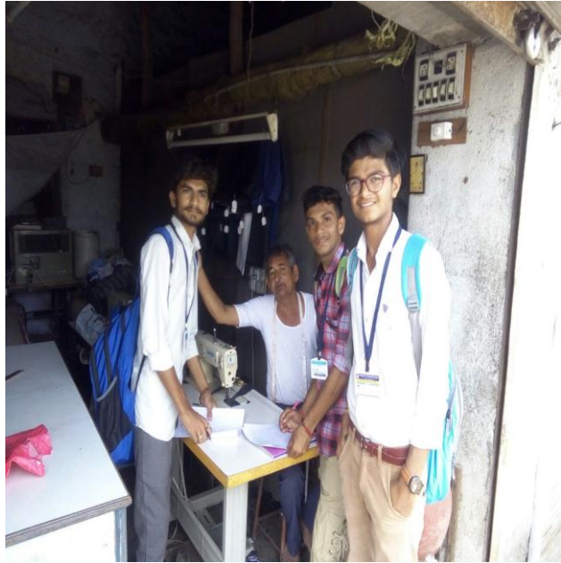
Door to door visit

The second day of an internship was very amazing and as per the planning, following activities were carried out: