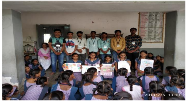
Prize distribution of drawing competition